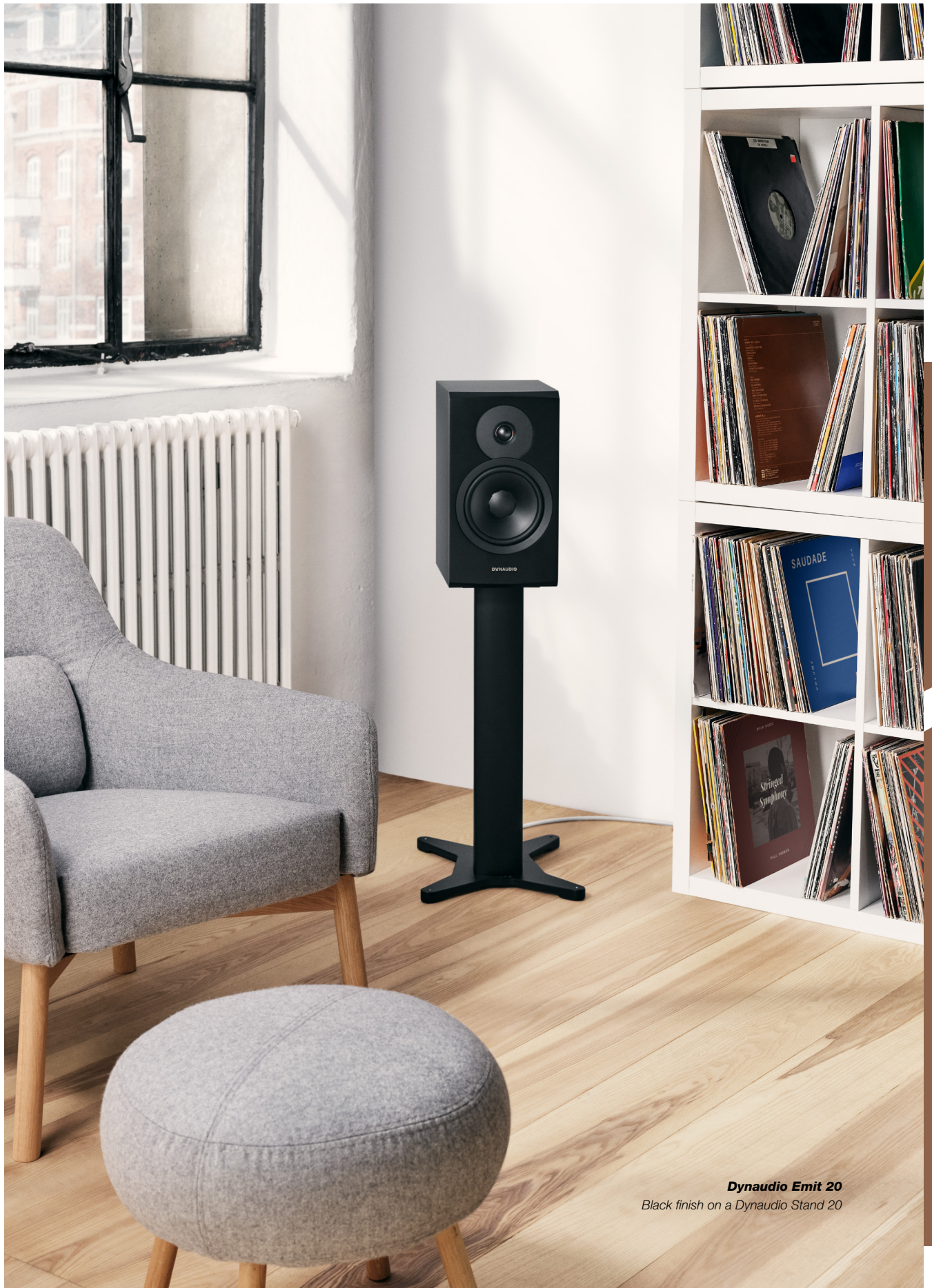
Dynaudio Emit 20 Black finish on a Dynaudio Stand 20